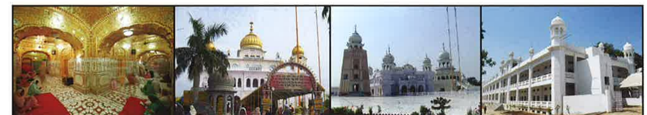
3. Takhat Sri Hazur Sahib, Nanded, Maharashtra 4. Sri Fatehgarh Sahib, Sirhind, Punjab 5. Takhat Sri Damdama Sahib, Bhatinda, Punjab 6. Guru's Langar Complex, Anandpur, Punjab